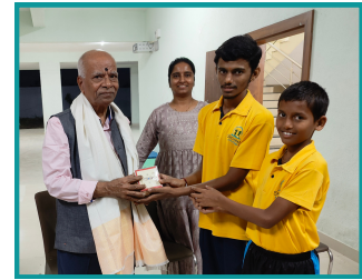
PADMASHRI RAMESH PATANGE