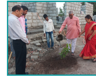
PADMASHRI DR. PRAKASH AMTE & MANDATAI AMTE

Happiness dies, when not shared. -Baba Amte