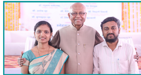
PADMA VIBHUSHAN, DR. RAGHUNATH MASHELKAR SIR