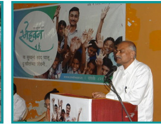
PADMASHRI DR. TATYARAO LAHANE